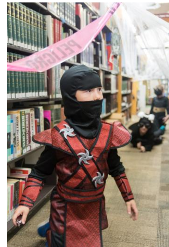
Fun during touch-a-truck, celebrating teen summer reading, and a ninja in the stacks