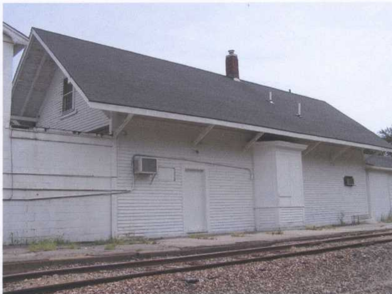
A view of the old train station from the tracks looking southeast.