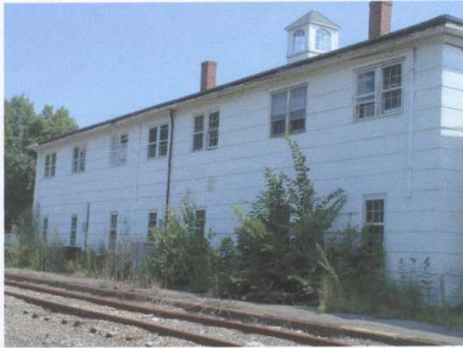
A view of the old train station from the tracks looking northeast.