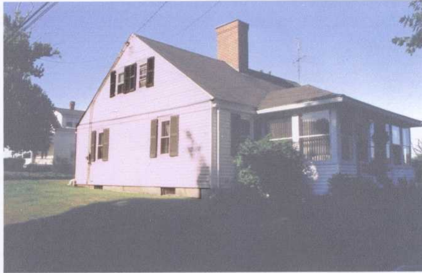
The back of the house.