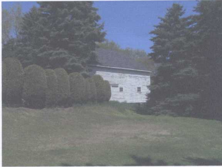
A view of the old barn.