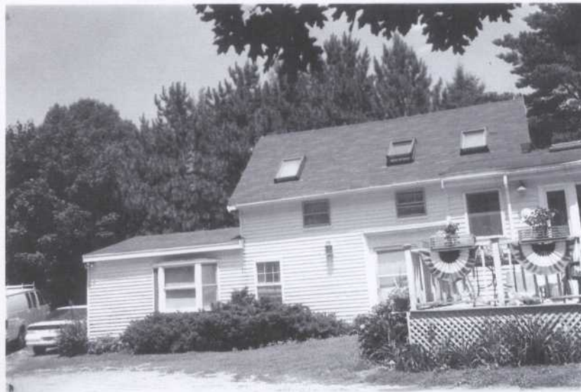
A view from the rear.