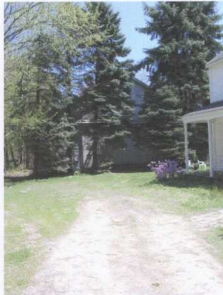
The barn was to the left rear of the house.