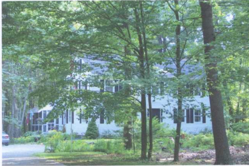
View showing left side.