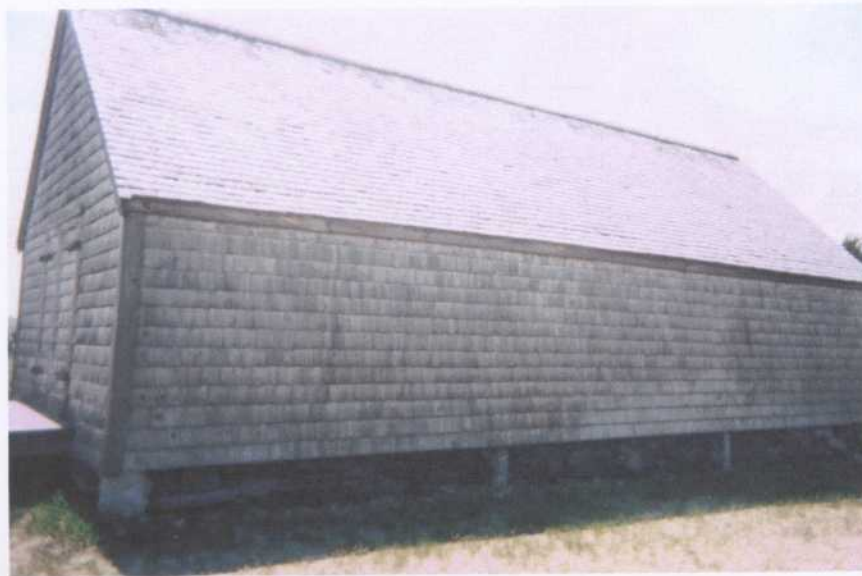
Side view of fish house.