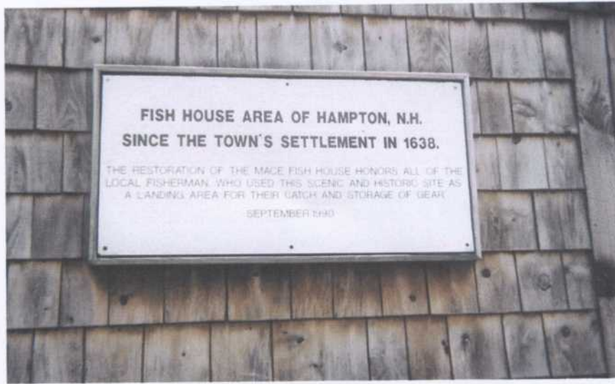
Close-up of identification on the Hampton fish house.