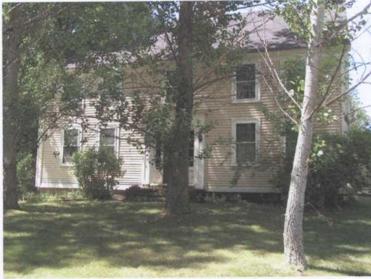
Front of house.