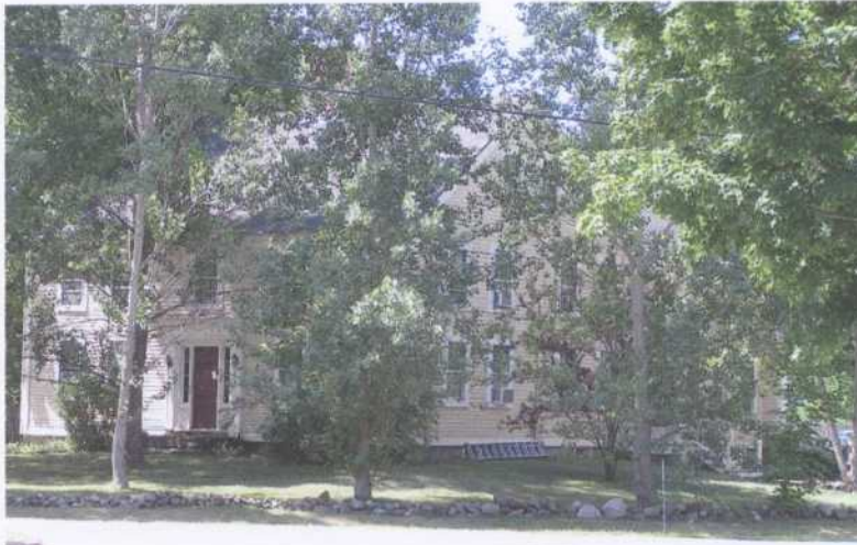
View from the right side.