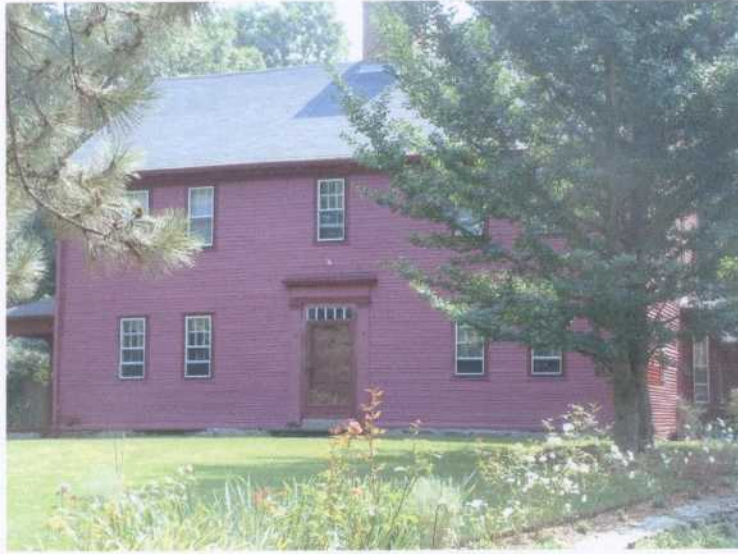
Better view of house facade.