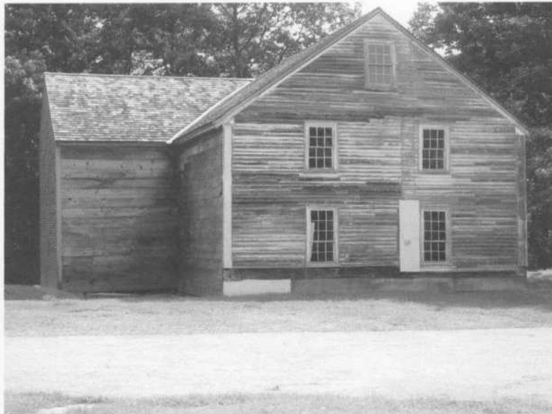
View from the west. A vertical line from the ground to the roof (partly covered by a white board) between the attic window and the two right windows indicates where a chimney for a heater in the right front parlor was removed.