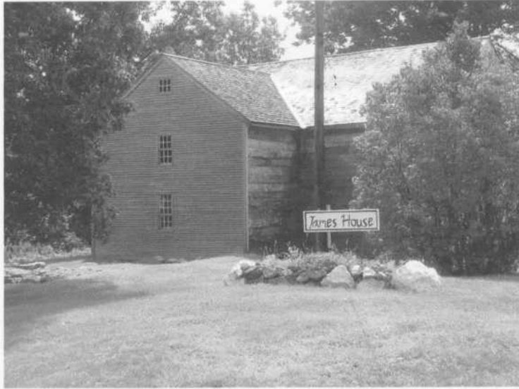
The James House from Towle Farm Road.